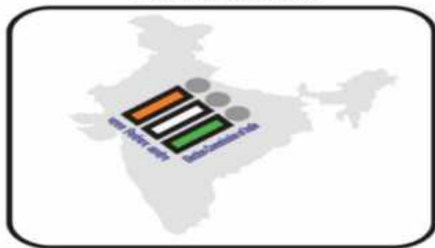
Sample of Hologram

To ensure that the hot stamped hologram is durable each order delivery should be accompanied by a "quality test report from a Govt. Lab" based on the following tests: -